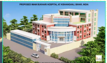
Imam Bukhari Hospital at Kishanganj, Bihar