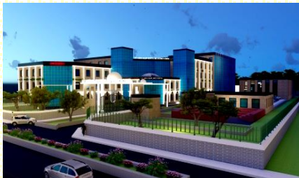
Cancer Hospital, Palwal, Haryana

Architect Division: limradesignsolutions@gmail.com Technical Division: limradesignsolutionstech@gmail.com Financial Division : ldsprojectsconsultant@gmail.com Accreditation Division : limradesignsolutions@gmail.com