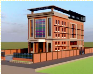
Silver crest hospital ,Ghaziipur, U.P