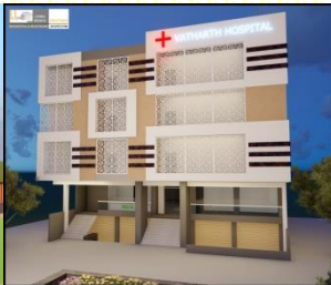
Vatharth hospital ,Noida, U.P