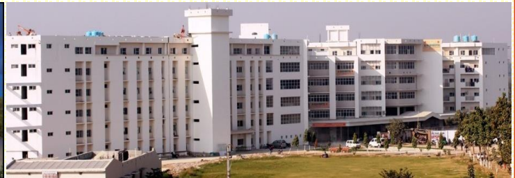
Hospital Block, Al-Falah University, Faridabad, Haryana